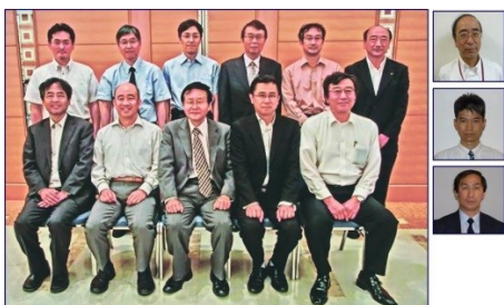
JHPS Executive Committee

Any comments and suggestions from radiation protection colleagues in the world to the recommendations are welcomed and appreciated.